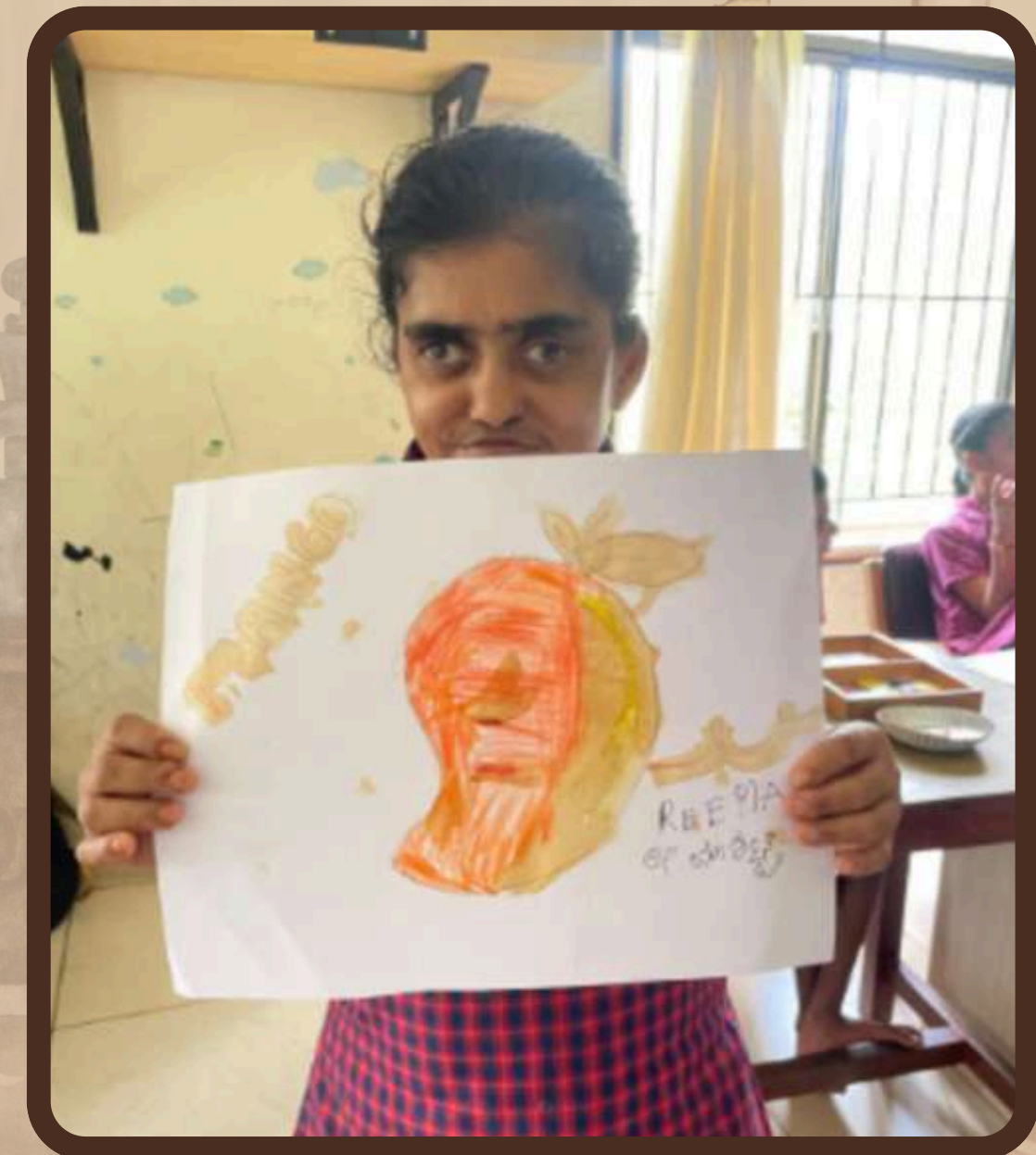
COFFEE PAINTINGS AT AASRE